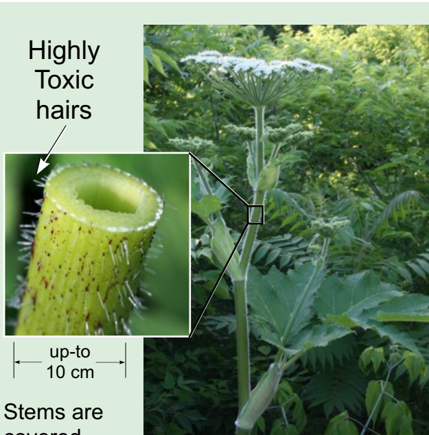
Highly Toxic hairs

in diameter, occasionally up to 10 cm. Each dark red spot on the stem surrounds a hair, and large, coarse white hairs occur at the base of the leaf stalk. The plant has deeply incised compound leaves which can grow up to 1.7 m width