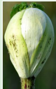
Large white flower heads emerge in the final year seeding in the autumn months

Leaves are deeply lobed, sharply pointed, and up to 1.5m