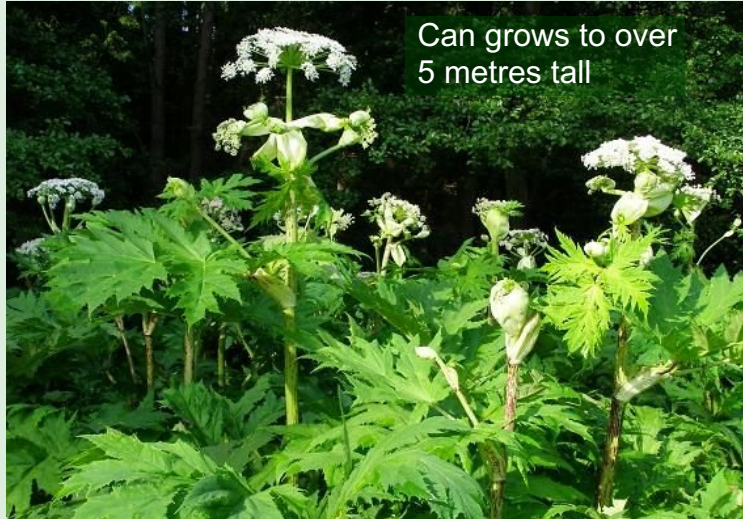
Can grows to over 5 metres tall