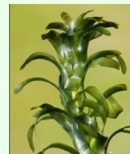
Large-flowered Waterweed stem

dispersal of this species will rely on the presence of dispersal vectors that transport fragments to new locations.