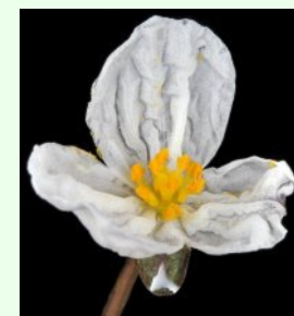
Large-flowered Waterweed flower

Reproduction: reproduces vegetatively through branching and fragmentation. Therefore, secondary