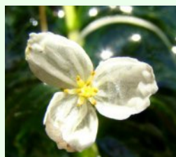
Large-flower waterweed flower

Plants usually have four leaves per node but can also have up to five or six. However, there can be as many as ten leaves at a fertile node.