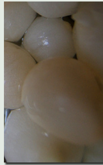
Three-cornered garlic bulbs

Reproduces by seed and vegetatively by its long-lived bulbs.