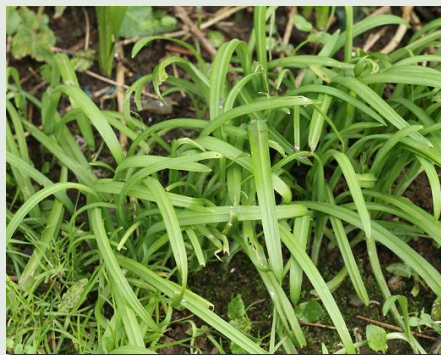
Three-cornered garlic leaves

Description: Three-cornered garlic is a very invasive plant due to seeds which germinate easily creating dense clumps of leaves and flowers. Native of the Mediterranean, preferring shady areas, but is tolerant of most conditions.