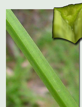
Three-cornered garlic triangular stem

The stem is similar to the leaves with a more triangular cross section profile than the leaves, giving rise to the common name, Three-cornered garlic.