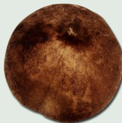
Three-cornered garlic seed