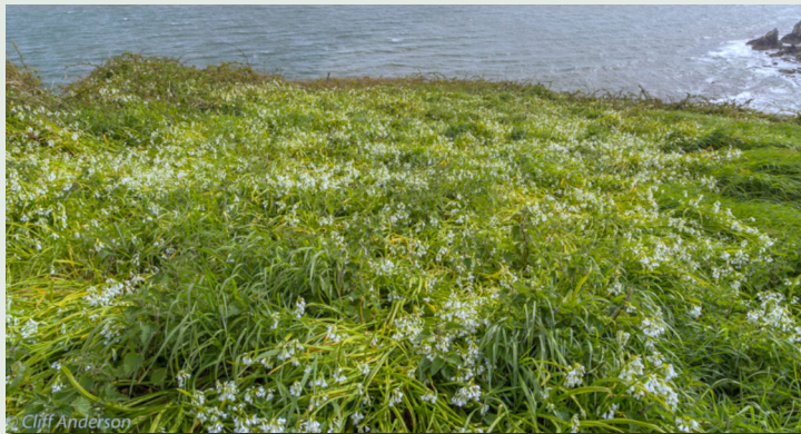
Three-cornered garlic meadow

Habitat: Terrestrial, prefers damp shaded areas Family name: Amaryllidaceae Common name: Snow Bell, Three-cornered garlic