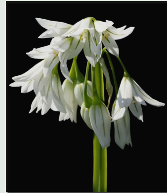
Three-cornered garlic flowers

Flowers appear from April to June and hang in clusters similar to bluebells with six petals and flowers from April to June.