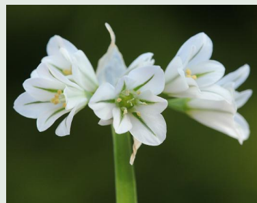
Three-cornered garlic stem head

The leaves are mid-green and hairless with a keel running up one side.