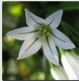
Three-cornered leek petals

As with all Alliums it forms a bulb as an underground storage unit when the leaves die away. The white bulbs reproduce vegetatively by dividing.