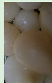
Three-cornered leek bulbs

Numerous smaller bulbs are produced from the base each year. The bulbs are spread when soil is moved or cultivated. Seeds can be dispersed by ants, water and contaminated soil.