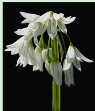
Three-cornered leek flowers

Flowers appear from April to June and hang in clusters similar to bluebells with six petals and flowers from April to June.