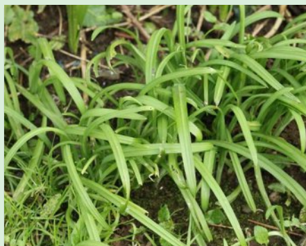
Three-cornered leek leaves

Description: Three-cornered leek is a very invasive plant due to seeds which germinate easily creating dense clumps of leaves and flowers. Native of the Mediterranean, preferring shady areas, but is tolerant of most conditions.