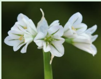
Three-cornered leek stem head

The leaves are mid-green and hairless with a keel running up one side to