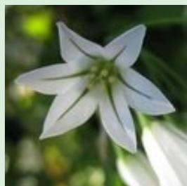
Three-cornered leek petals

As with all Alliums it forms a bulb as an underground storage unit when the leaves die away. The white bulbs reproduce vegetatively by dividing.