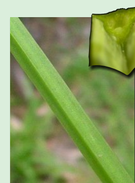
Three-cornered leek triangular stem

The stem is similar to the leaves with a more triangular cross section profile than the leaves, giving rise to the common name, Three Cornered Leek.