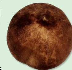
Three-cornered leek seed