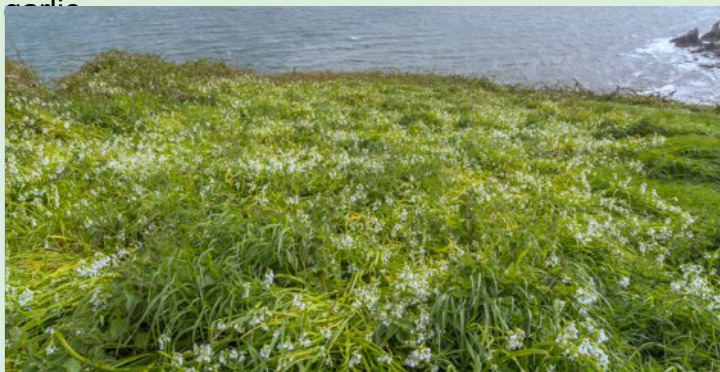
Three-cornered leek meadow

Description: Three-cornered leek is a very invasive plant due to seeds which germinate easily creating dense clumps of leaves and flowers. Native of the Mediterranean, preferring shady areas, but is tolerant of most conditions.