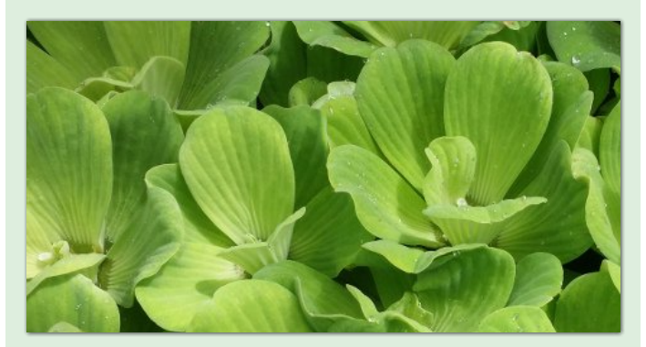
Water Lettuce Leave

thick, soft leaves that form a rosette. It floats on the surface of the water, its roots hanging submersed beneath floating leaves. The leaves can be up to 14 cm long.