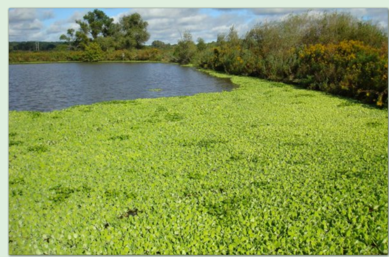
Large Water Lettuce Stand