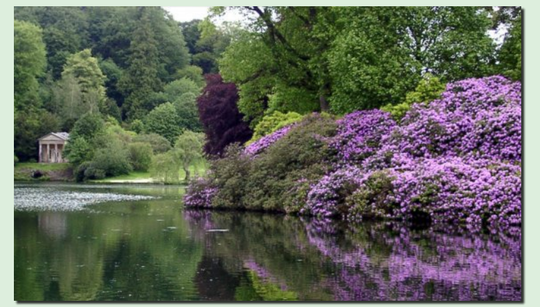
Rhododendron Riverside Stand

Description: Rhododendron is a large perennial evergreen, acid loving shrub which is native to the Iberian Peninsula and Asia. A dense, suckering shrub or small tree growing to 5 m tall, rarely 8 m.