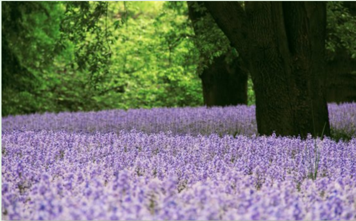
Spanish Bluebell woodland stand

Description: Spanish Bluebells is a bulb forming perennial plant that can aggressively compete with native spring-blooming wild flower species.