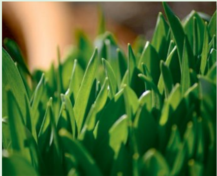
Spanish Bluebell Leaves

It can spread rapidly by sending out underground