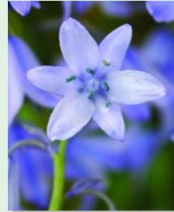
Flower with blue anthers

Flowers borne on short stalks, ( raceme ), each with 6-8 conical or bell-shaped flowers with spread out tips that hang when in bloom Pale blue-purple