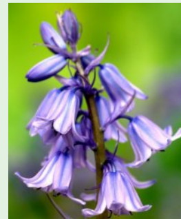
Spanish Bluebell Flowers

Flowers develop on all sides of upright stem, usually nodding flowers have almost no scent usually with blue anthers.