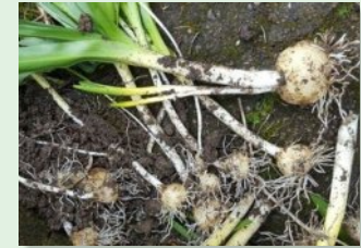
Spanish Bluebell bulbs & roots

Vegetative reproduction of the plants occurs rapidly via root suckers.