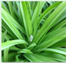
Spanish Bluebell leaves

The Spanish Bluebell is native to Spain and Portugal, and parts of Africa