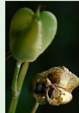
Spanish Bluebell seed pods

The roots also transform insoluble organic and mineral matters from the soil into more soluble states.