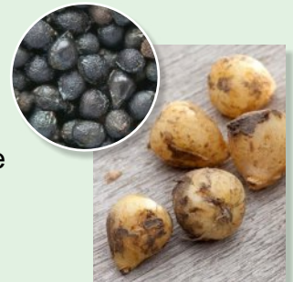
Spanish Bluebell seeds & bulbs

The oval or lightly roundish fruits grow in compact grapes varying from pale yellow to dark orange containing a higher amounts of vitamin B12 than other fruits.