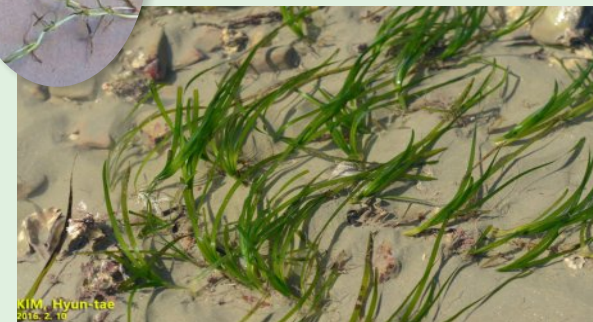
KIM, Hyun-tae 2016, 2, 10

Similar species: Seawrack ( Zostera marina ) is a native eelgrass that looks similar to dwarf eelgrass. Seawrack can be distinguished from dwarf eelgrass by the presence of longer stems ( over 183 cm long ), bigger leaves ( up to 110 cm long and 12 mm wide ), five to eleven veins per leaf, and round leaf apices.