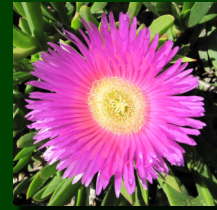
Hottentot-fig Pink Flower

Plants can also be spread by birds using fragments as nesting material.