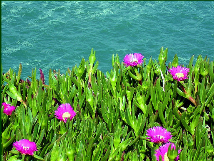
Hottentot-fig Infestation on Cliff-top

Habitat: Terrestrial, coastal Family name: Aizoaceae