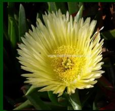
Hottentot-fig Yellow Flower

Flowers are solitary, 100–150mm in diameter, yellow, fading to pale pink. Plants in Ireland are