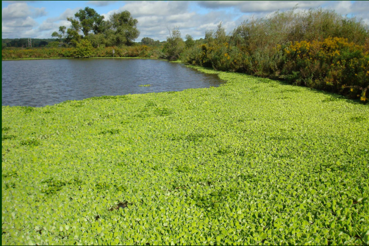
Large Water Lettuce Stand

Common name/s: Floating Lettuce, Water Cabbage, Jalkumbhi