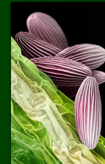
Water Lettuce Pollen

Seeds are easily carried by water for long distances, since they float during the first two days after they reach maturity.