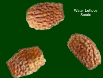
Water Lettuce Seeds