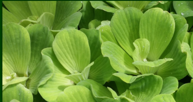
Water Lettuce Leave

thick, soft leaves that form a rosette. It floats on the surface of the water, its roots hanging submersed beneath floating leaves. The leaves can be up to 14 cm long.