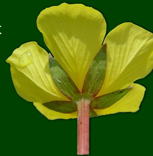
Water-primrose flower sepals

Each of the creeping water-primrose's bright yellow flowers has five petals and grows on a long stalk arising from a leaf axil, where the leaf attaches to the plant stem.