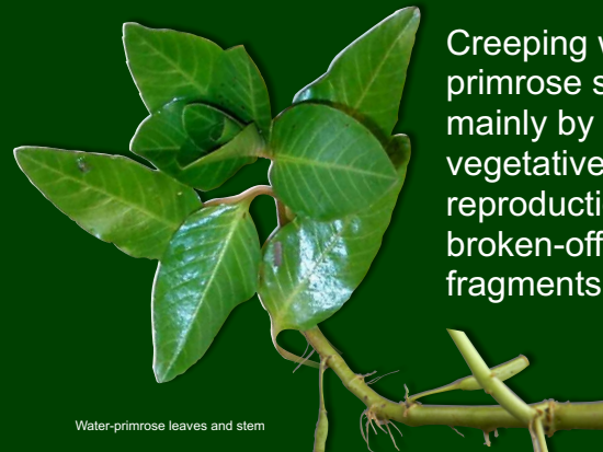
Water-primrose leaves and stem

Water-primrose leaves are arranged alternately along stems and can be ovate (egg shaped) or slender in shape.