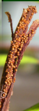
Water-primrose seed pods & seeds

The fruit of the creeping water-primrose is a long, narrow, cylindrical capsule between 1 to 4 cm long and contains numerous small seeds